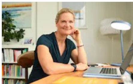
I'm a sleep scientist. This is how to get a better night's sleep during winter