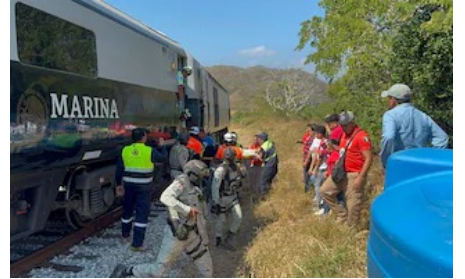
At least 13 people dead after train derails in Mexico