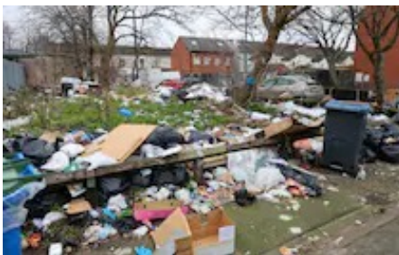
Christmas trees dumped on Birmingham streets after almost 12 months of bin strikes