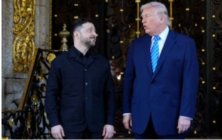
Ukraine security guarantees 95pc agreed, says Trump