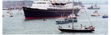
Revealed: Irish concerns over 'opulence' of Royal Yacht Britannia