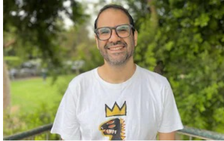
Starmer under pressure to strip 'extremist' of British citizenship