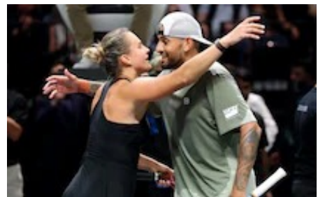
Kyrgios defeats Sabalenka in farcical 'Battle of Sexes' pantomime