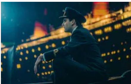
The minute-by-minute horror of the Titanic's fate is not quite what you want for Christmas