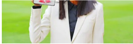
What's gone wrong with the honours system?

Javier Milei: I am convinced mine is the best government in history