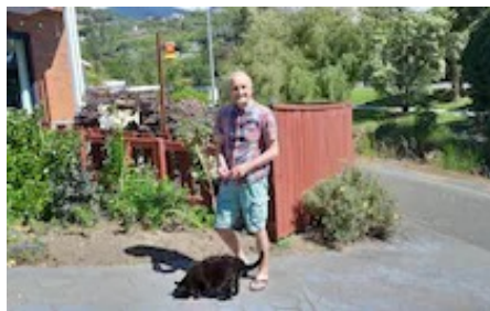
The British expat fighting to recover £100,000 from New Zealand's 'immoral' pension policy