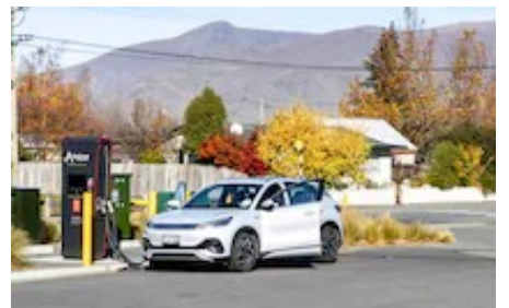
Why New Zealand's 'alarming' pay-per-mile backfire should worry Labour