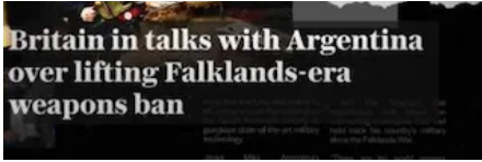
Britain in talks with Argentina over lifting Falklands-era weapons ban

Javier Milei: I am convinced mine is the best government in history