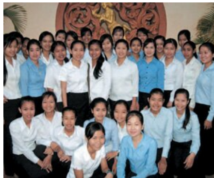
Charity funded Leadership Centre