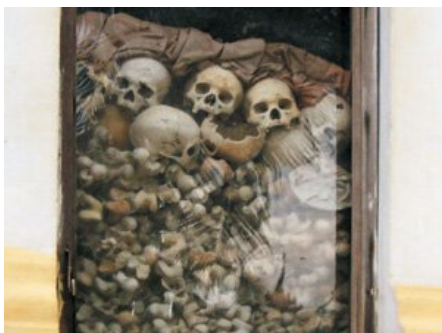
The Killing Fields

In May 2008, Alan Lightman, founding director of the Harpswell Foundation, was awarded the Gold Medal for Humanitarian Service to Cambodia by the government of Cambodia for his work. Lightman indicated to Jewish Times Asia, that while the foundation is not a Jewish organisation, he of course is in part driven to aid Cambodia by his own Judaism.