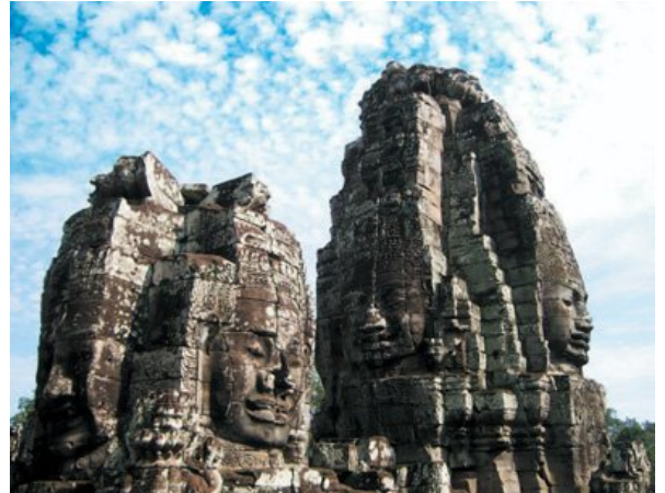
Temples of Angkor

While there are photographs of these stupahs readily available on the web and in books, still nothing compares to seeing them firsthand.