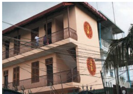
Dormitory built by the Harpswell Foundation